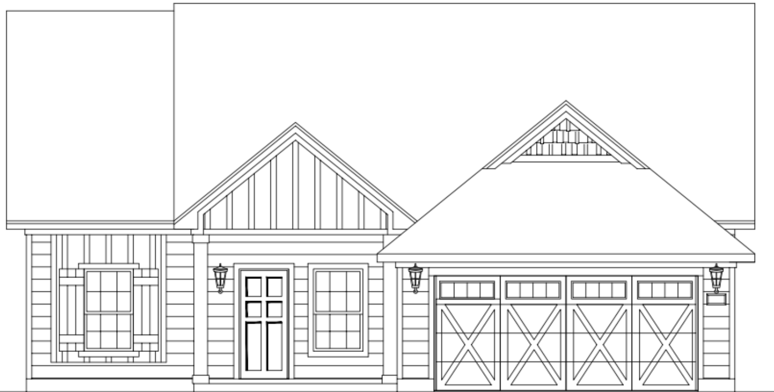
FRONT ELEVATION "B"